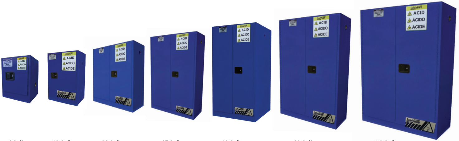
4 Gallons 12 Gallons 30 Gallons 45 Gallons 60 Gallons 90 Gallons 110 Gallons