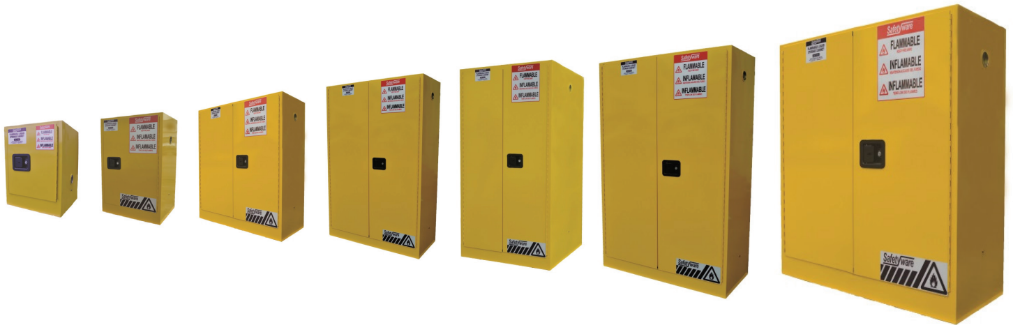
4 Gallons 12 Gallons 30 Gallons 45 Gallons 60 Gallons 90 Gallons 110 Gallons