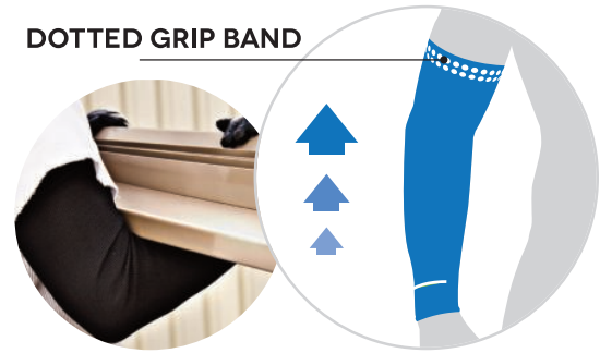
DOTTED GRIP BAND

No more slipping! Sleeves with arm openings featuring "STAYz-Up" technology hold up—comfortably gripping onto underlying fabric or skin to ensure sleeves stay in place, and keep you protected no matter what. Unlike other products on the market, we won't let you down.