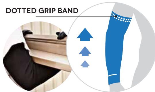
DOTTED GRIP BAND

No more slipping! Sleeves with arm openings featuring "STAYz-Up" technology hold up—comfortably gripping onto underlying fabric or skin to ensure sleeves stay in place, and keep you protected no matter what. Unlike other products on the market, we won't let you down.