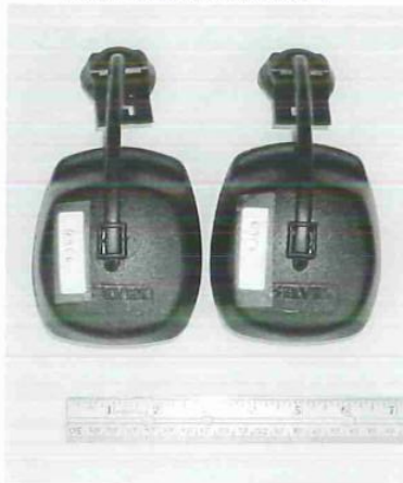
Test Item: Q956A

These data were obtained through measurements made at the laboratories of Michael & Associates, Inc., State College, PA, USA. Michael & Associates, Inc., is accredited to test to ANSI S3.19-1974 and ANSI S12.6-1997 by the National Institute of Standards and Technology (NIST) National Voluntary Laboratory Accreditation Program (NVLAP).