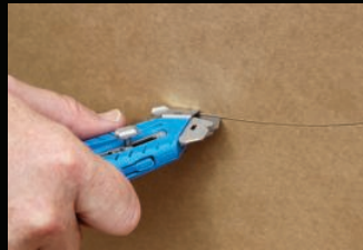
Tray Cut / Window Cut