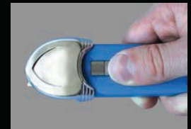
Tray Cut C Position For Minimum Blade Depth