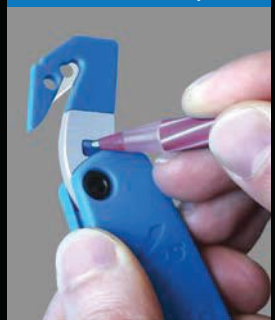
FILM CUTTER CHANGE Use ball point pen (above) to remove & replace film cutter unit.