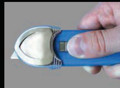
Tray Cut B Position For Medium Blade Depth