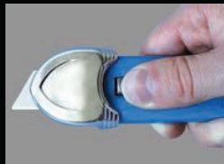
Tray Cut A Position For Maximum Blade Depth