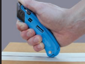
Blade-less tape splitting eliminates cut injuries