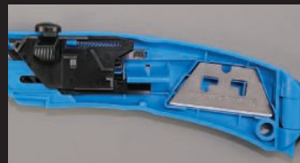
Remove spare blade from blade compartment. Use only S Series replacement blades: #SP-017, SPD-017 or PBDSP017B.