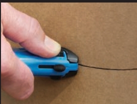
3 Button design for convenient tray cuts