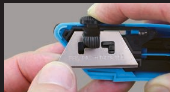
Remove used blade from blade retainer and dispose of safely.