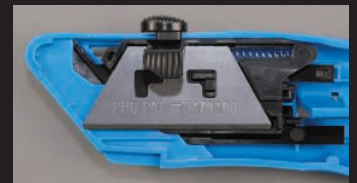
Insert new blade underneath blade retainer, align blade notch with alignment tab. Close cutter.