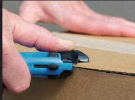
Spring back safety guards for safe top cuts