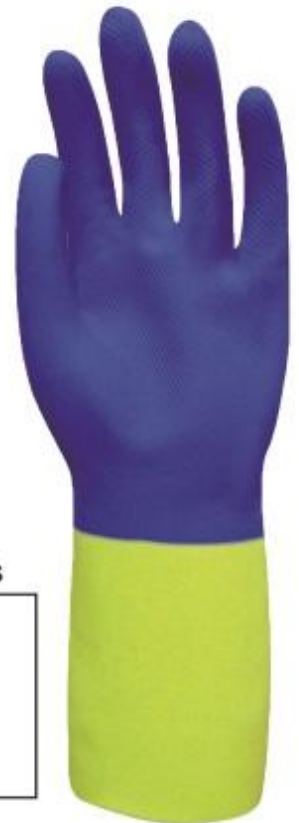
BC2113 / BC2813