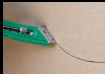
Tray Cut / Window Cut