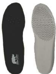
Front Back PU-INSOLE