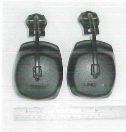
Test Item: Q953A

These data were obtained through measurements made at the laboratories of Michael & Associates, Inc., State College, PA , USA. Michael & Associates, Inc., is accredited to test to ANSI S3.19-1974 and ANSI S12.6-1997 by the National Institute of Standards and Technology (NIST) National Voluntary Laboratory Accreditation Program (NVLAP).