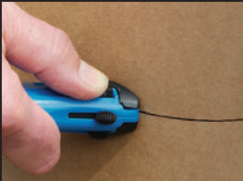
3 Button design for convenient tray cuts