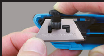
Remove used blade from blade retainer and dispose of safely.