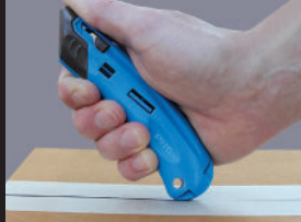
Blade-less tape splitting eliminates cut injuries