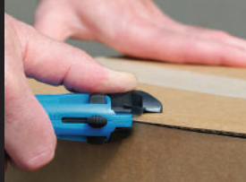
Spring back safety guards for safe top cuts