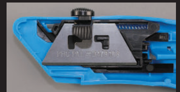
Insert new blade underneath blade retainer, align blade notch with alignment tab. Close cutter.