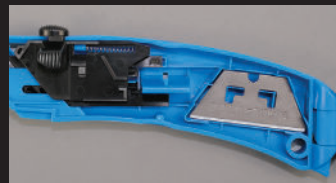
Remove spare blade from blade compartment. Use only S Series replacement blades: #SP-017, SPD-017 or PBDSP017B.