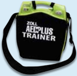
AED Plus Trainer Carry Case Part# 8000-0375-01