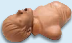
AED Plus Trainer Demo Manikin Part# 8000-0835-01