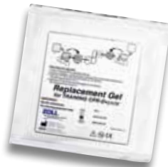
Replacement Adhesive Gels for CPR-D-padz Trainer Electrodes Part# 8900-0803-01

(Replacements must be ordered separately)