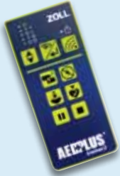
AED Plus Trainer2 Replacement Remote Part# 8008-0007