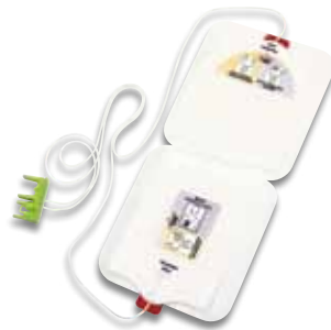
Stat-padz® II Trainer Electrodes Part# 8900-0805-01 (case of 6)