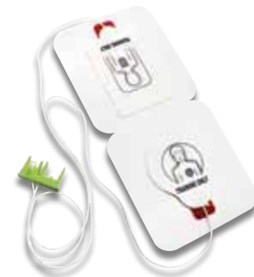
Pedi-padz® II Trainer Electrodes Part# 8900-000861-01 (case of 6)