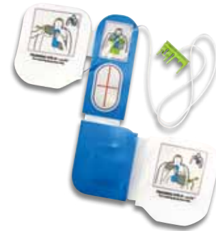
CPR-D-padz Trainer Electrodes Part# 8900-0804-01