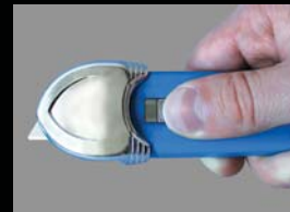
Tray Cut B Position For Medium Blade Depth