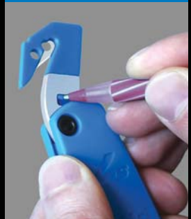
FILM CUTTER CHANGE Use ball point pen (above) to remove & replace film cutter unit.