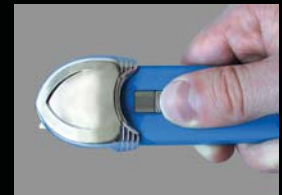
Tray Cut C Position For Minimum Blade Depth