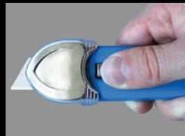
Tray Cut A Position For Maximum Blade Depth