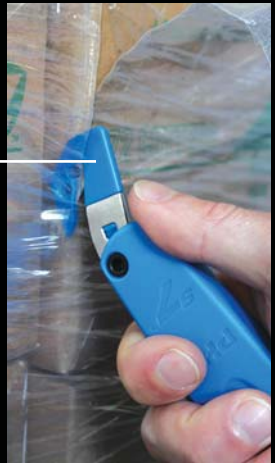
Easily Cuts Shrink Wrap