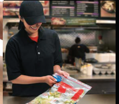
Cut For Resealing