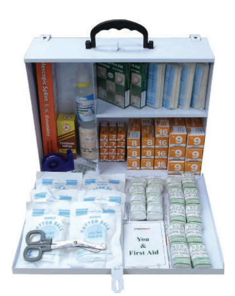
Box B 11-50 working employees