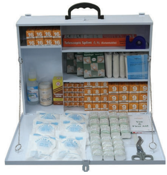
Box C over 50 working employees