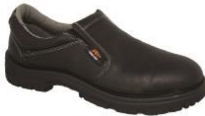
C-102 / C-102SP