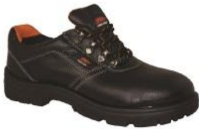
C-101 / C-101SP