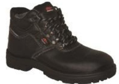
C-201 / C-201SP