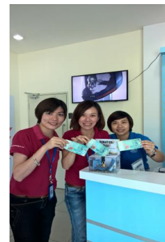
Recycling & Donation Box