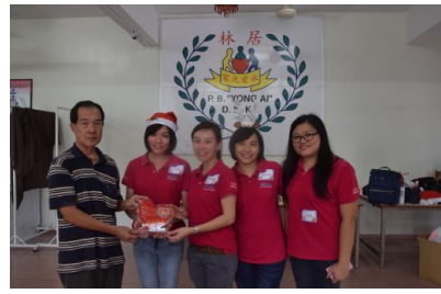
Cheque Giving Ceremony & Souvenir Giving