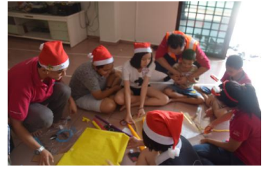
Building Paper Car